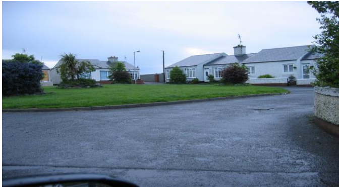
St Mary’s Park Group Housing Scheme, Dunsink Lane, Dublin 10

All projects are subject to agreement with the LTACC, Traveller Representative Groups and most importantly the members of the Traveller Community within the Local Authority Area 40 .