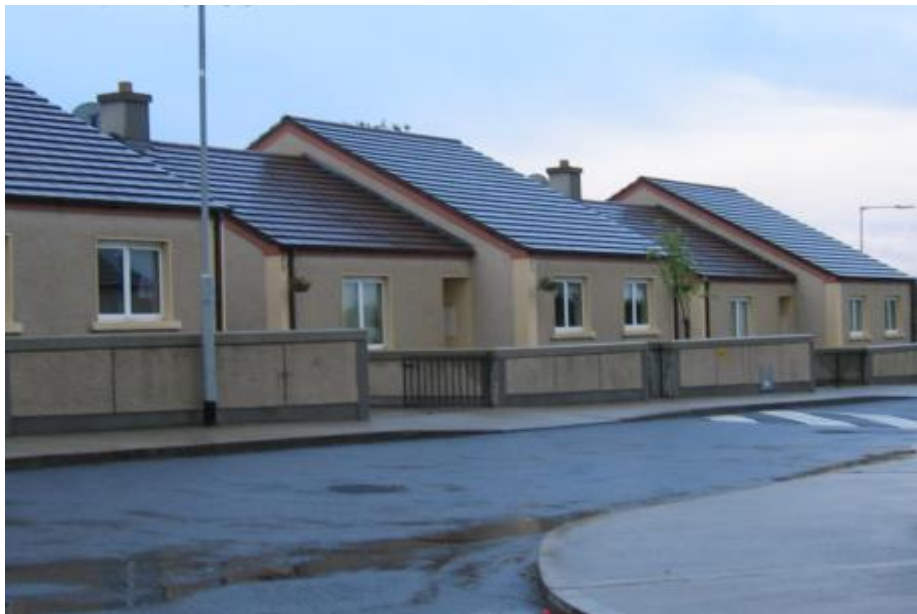
Avila Group Housing Scheme, Finglas, Dublin 11